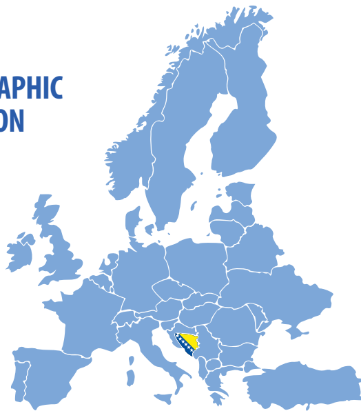
Bosnia & Herzegovina in Europe