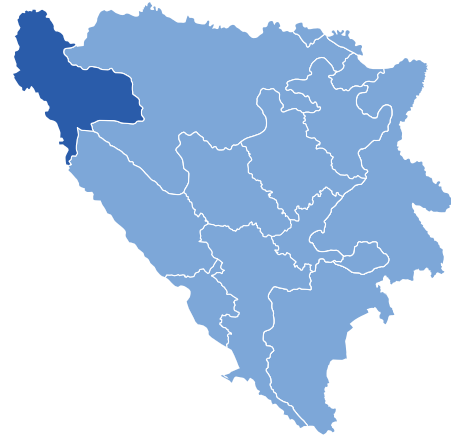
Una-Sana Canton in Bosnia & Herzegovina

Una-Sana Canton (USC) is one of the ten cantons within the Federation of B&H. USC was established by the Decision of the Presidency of Bosnia & Herzegovina (B&H) on 27 May 1995. USC is located at the very North-West part of B&H on the border with the South and South-Eastern part of the Republic of Croatia. B&H is a member of Central European Free Trade Agreement (CEFTA) and European Free Trade Association (EFTA).